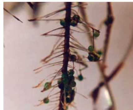
The Adhesive eggs attached to roots of water hyacinth.

We are grateful to the PIU, National Agriculture Technology Project, New Delhi for financial assistance and