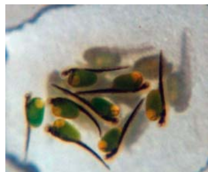
The Hatchlings of M. aculeatus .