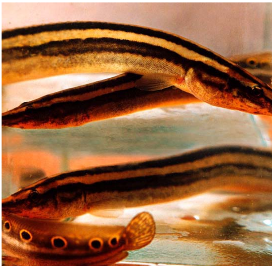
The peacock eel (M.aculeatus) broodstock

Considering their potential, a few fish species have been recently short-listed for research on captive breeding under a National Agriculture Technology project in the Assam Agricultural University at College of Fisheries, Raha. The project has so far been successful in captive breeding of